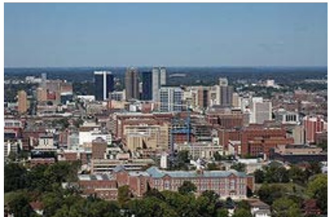
City of Birmingham, Alabama

National Oncologic PET Registry (NOPR), was designed to meet coverage requirements and to assess how FDG PET affects care decisions.